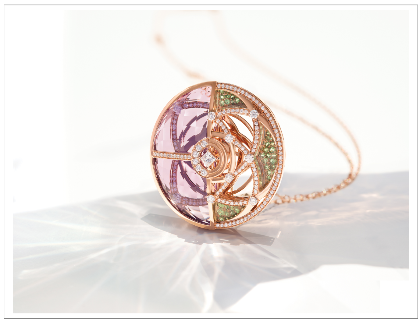
Aeterna Medallion: Custom-cut Purple and Green Amethyst

interconnectedness-Aeterna interprets geometric patterns as symbols of life. Initially envisioned in Purple Amethyst, representing feminine energy, Aeterna now evolves with the introduction of Green Amethyst, a gemstone symbolising renewal — creating a dual-toned narrative.