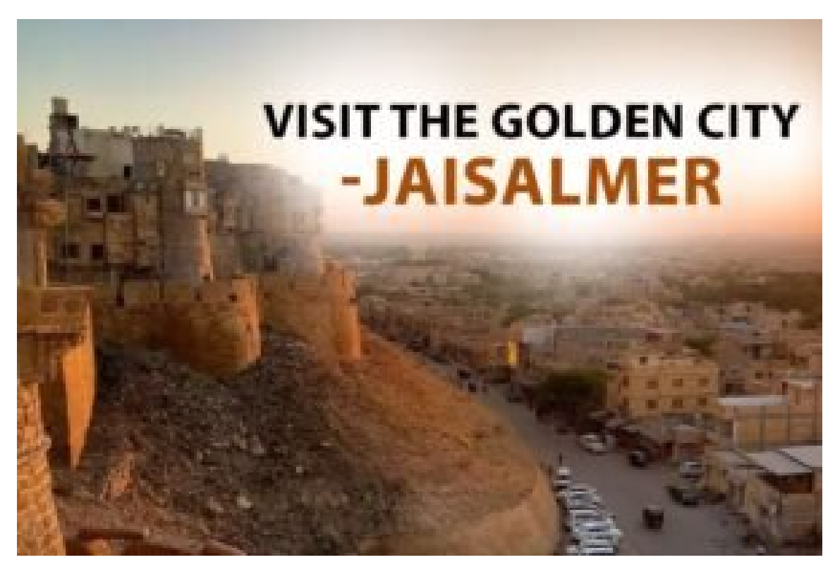
Jaisalmer - The Golden City in Rajasthan

exploring its nooks and crannies is a journey through time. Whether you're a history buff, an architecture enthusiast, or simply a <u>traveler</u> seeking a unique experience, the Jaisalmer Fort will leave an indelible mark on your memory.