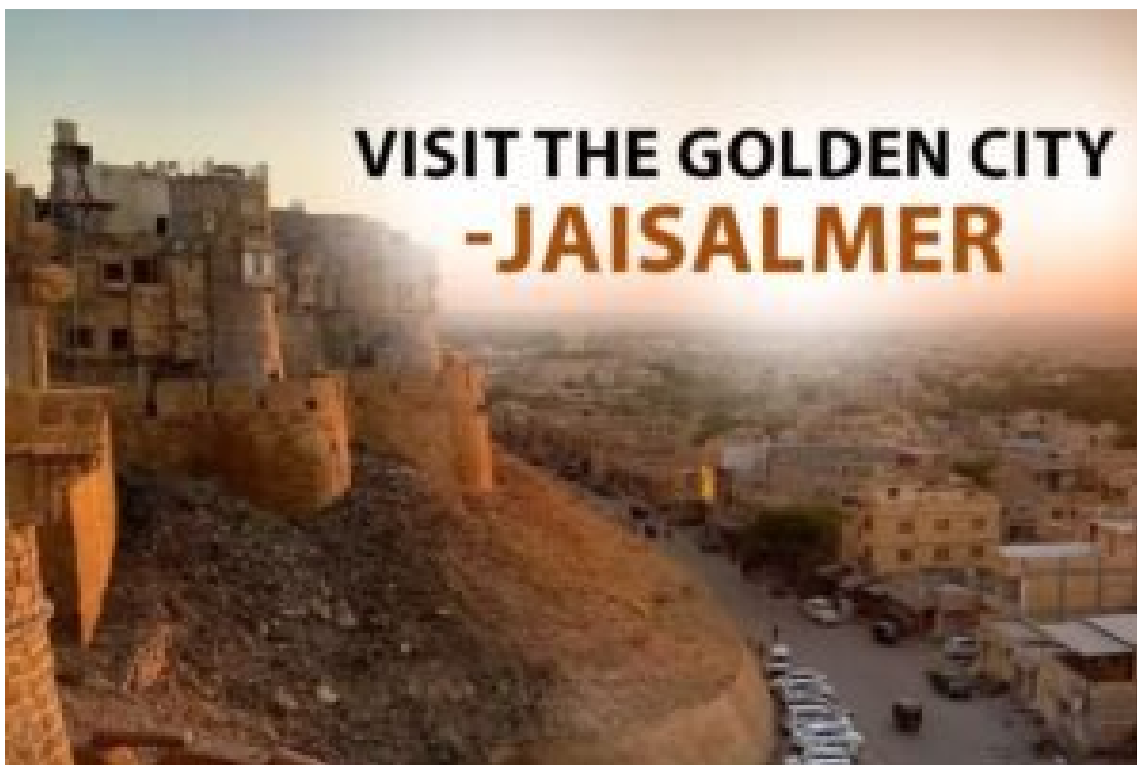
Jaisalmer – The Golden City in Rajasthan

exploring its nooks and crannies is a journey through time. Whether you're a history buff, an architecture enthusiast, or simply a traveler seeking a unique experience, the Jaisalmer Fort will leave an indelible mark on your memory.