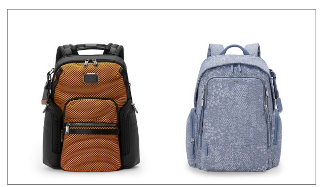
(L to R): Alpha Bravo <u>Navigation</u> Backpack in Red/Lime Chameleon, Voyageur Celina Backpack in Denim Blue

Our captivating Spring capsule pays homage to the vibrant colors found in Perus breathtaking landscapes and bustling markets. This collection features select pieces from the Voyageur, Georgica, Alpha Bravo, 19 Degree and TUMI Travel Accessories collections. Blending fashion with functionality, the assortment comes alive with striking patterns like Denim, Red/Lime Chameleon, and Natural/Sand, complemented by a variety of seasonal charms honoring Perus natural beauty.