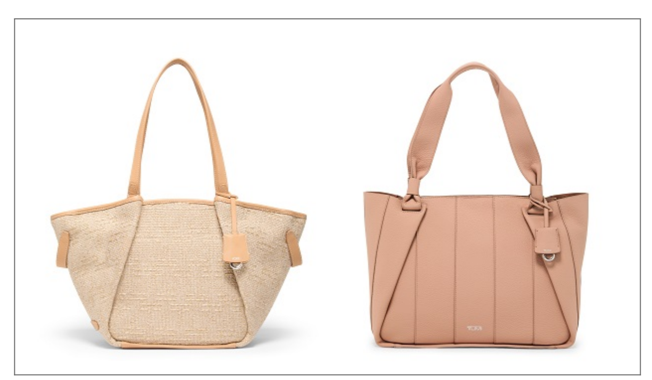
(L to R): Georgica Lima Medium Tote in Natural/Sand and Valorie Tote in Lilyâ \square

This season, womens styles receive an exciting refresh with vibrant new silhouettes and colorways. The Voyageur collection , known for its versatility, is tailored to meet the everyday needs of women. The Spring 2025 collection introduces the chic Evora Hobo silhouette, along with fresh seasonal hues like Lagoon , Lavender and Denim Blue . Additionally, the womens Georgica collection is revitalized with stunning new shades, including the soft pink Lily . New arrivals feature the Lima Medium Tote , subtly adorned with the iconic "T" logo pattern and accented by the sophisticated Natural/Sand colorway.