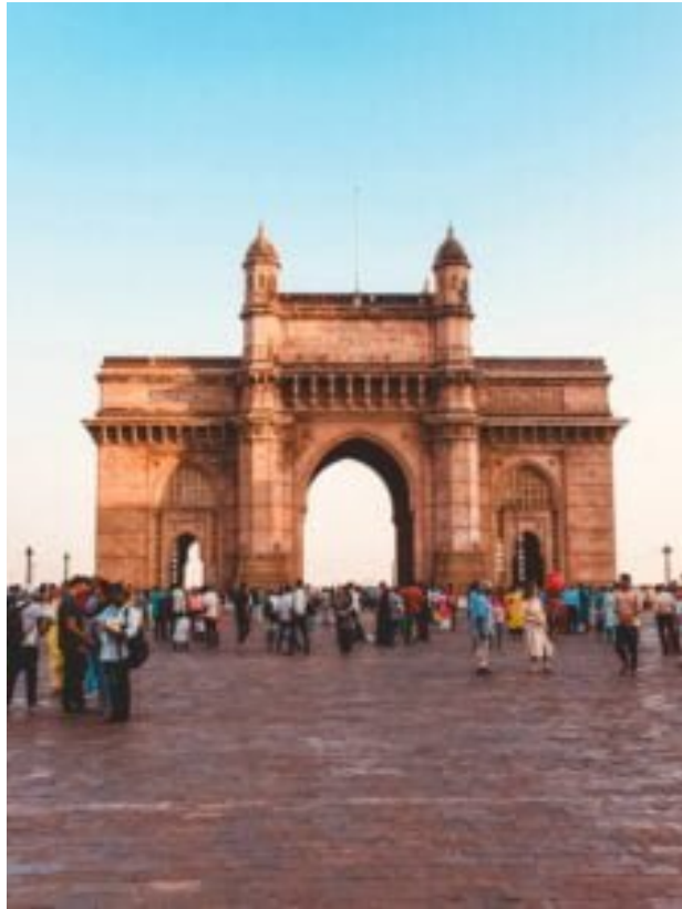
Gateway of India

Visitors can also take a boat ride from the Gateway of India to explore the nearby Elephanta Caves, a UNESCO World Heritage Site known for its ancient rock-cut temples. The monument is surrounded by various other attractions, including the Taj Mahal Palace Hotel, which adds to its allure.