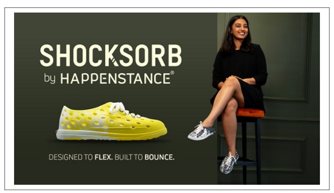
Radhika Apte kicks off the Shocksorb by Happenstance campaign — redefining street style with bounce-back <u>technology</u>

Unlike many Indian footwear brands that import and white-label products, Happenstance develops its own materials and formulations, ensuring high-performance comfort tailored for Indian consumers. The brand's Department of Applied Biomechanics has extensively researched midsole and outsole technology, creating Innovative creations like Shocksorb Shoes and Sandals with proprietary designs that enhance comfort and performance. This innovation caters to India's unique fashion sensibilities while maintaining affordability, making Shocksorb Shoes and Sandals a game-changer in the market.