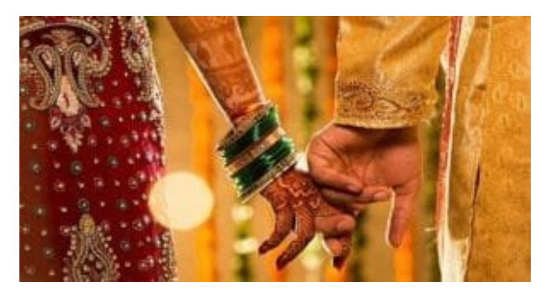
Pre-Matrimonial Investigation Services

When approached for a case involving potential infidelity or matrimonial issues, our team conducts a thorough preliminary assessment. This phase is critical in understanding the client's unique situation and emotional state. At NIS <u>India</u>, we believe that each case is different and should be treated with individualized attention. We encourage clients to share their concerns, as this helps tailor our investigative strategies to <u>meet their specific needs</u>.