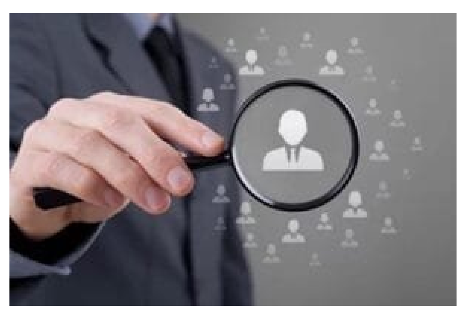
Locate a Missing Person

Locating missing persons is a daunting task that requires not only investigative acumen but also a deeply humane approach. At NIDAAN Intelligence Services (NIS <u>India</u>), we are acutely aware of the emotional turmoil faced by families during such distressing times. Our methodology combines strategic investigation with sensitivity to <u>ensure that we provide support</u> to families while we work to bring their loved ones home.