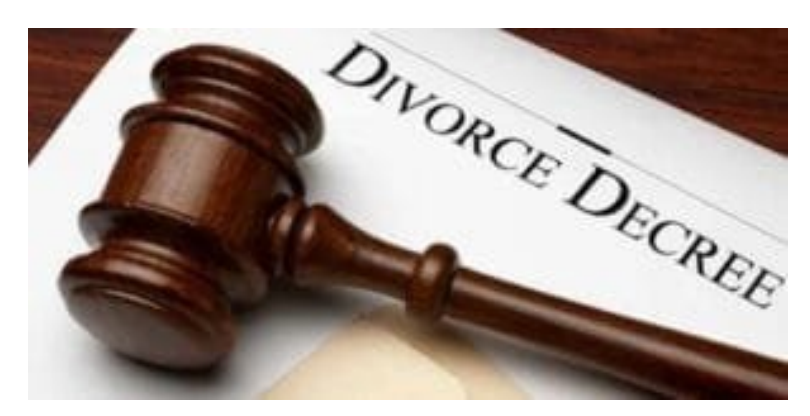
Divorce Case Investigation

Divorce proceedings can be one of the most challenging