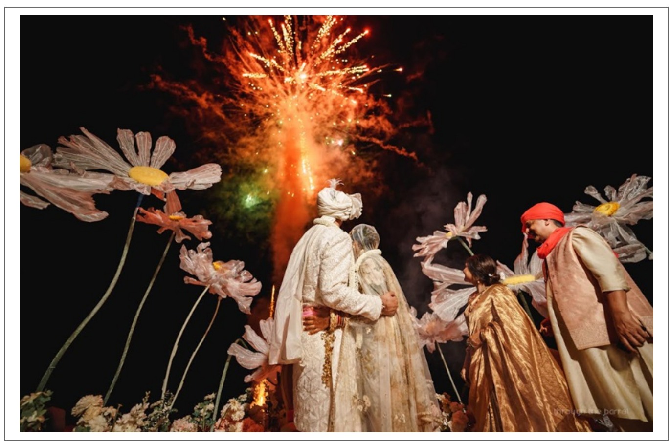
Memories by Minor Hotels