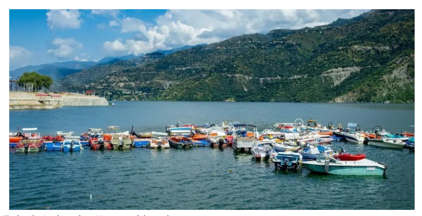
Tehri Lake in Uttarakhand

One of the highlights of the floating resort is the private deck that extends into the lake. You can relax on the deck, soak up the sun, or take a dip in the refreshing waters. The resort also offers various water activities such as kayaking, paddle boarding, and <u>fishing</u>, allowing you to make the most of your time on the lake.