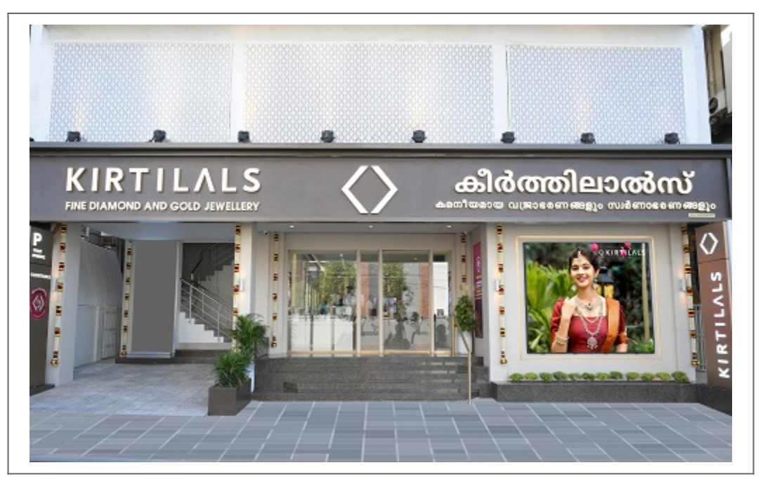
Kirtilals New Retail Showroom at Thiruvananthapuram

A unique highlight of the new Kirtilals showroom is the integrated Bridal Studio, designed to elevate the bridal jewellery shopping experience. The studio offers a vast range of bridal pieces, including intricate bridal sets, bangles, necklaces, and earrings. Featuring state-of-the-art technology, customers can visualize their custom jewellery designs before making a final decision, ensuring their complete satisfaction.