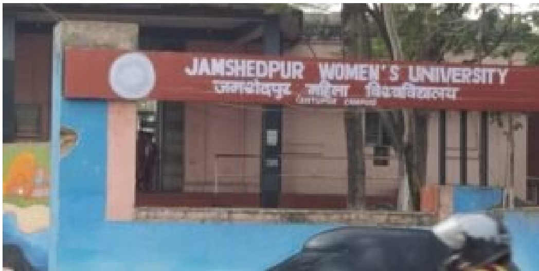
Jamshedpur Women's University – Old Campus

Jamshedpur Women's University also takes its social and government responsibilities seriously. The university offers fee concessions to the children of disabled individuals and martyrs from the police, army, CRPF, defense, and para-military forces. Additionally, students excelling in sports , physically challenged students, and children of university employees are also eligible for fee concessions.