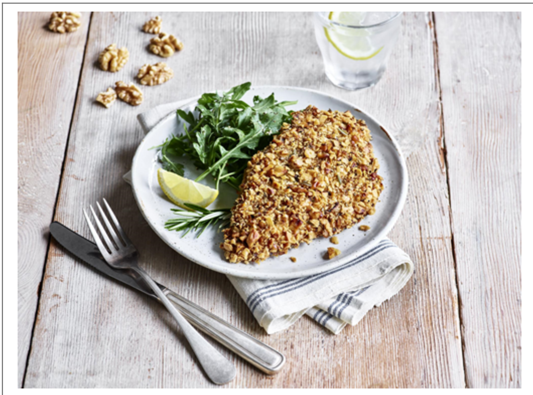
California Walnuts Crusted Chicken

Not all holiday recipes need to be strictly followed. Ingredient substitutions are a great way to exercise creativity in the kitchen and pay attention to your health at the same time. For example, skip the breadcrumbs and use finely chopped California walnuts as a coating for fish or poultry instead. Not only is this a nutritious alternative, but it also adds a delicious crunch. They are also an ultimate kitchen essential, delivering a plant-based nutritional punch, endless versatility, and unbeatable flavor. If you're looking to make a variety of sauces this holiday season, grind walnuts into a meal and use them as a creamy and wholesome thickener for your sauces. Remember, there's no need to compromise nutrition or taste when you're making your favorite holiday recipes!