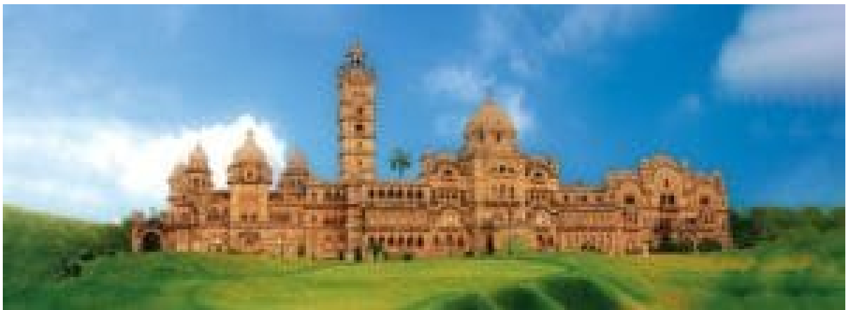
Laxmi Vilas Palace

The Laxmi Vilas Palace, renowned as one of the largest private residences in the world , embodies a harmonious blend of royal traditions and contemporary lifestyle, largely influenced by Radhikaraje Gaekwad's vision. Her stewardship has ensured that while the palace remains a symbol of regal heritage, it also serves as a vibrant part of modern society. This unique juxtaposition has allowed the palace to continue to thrive as both a historical monument and a living cultural space.