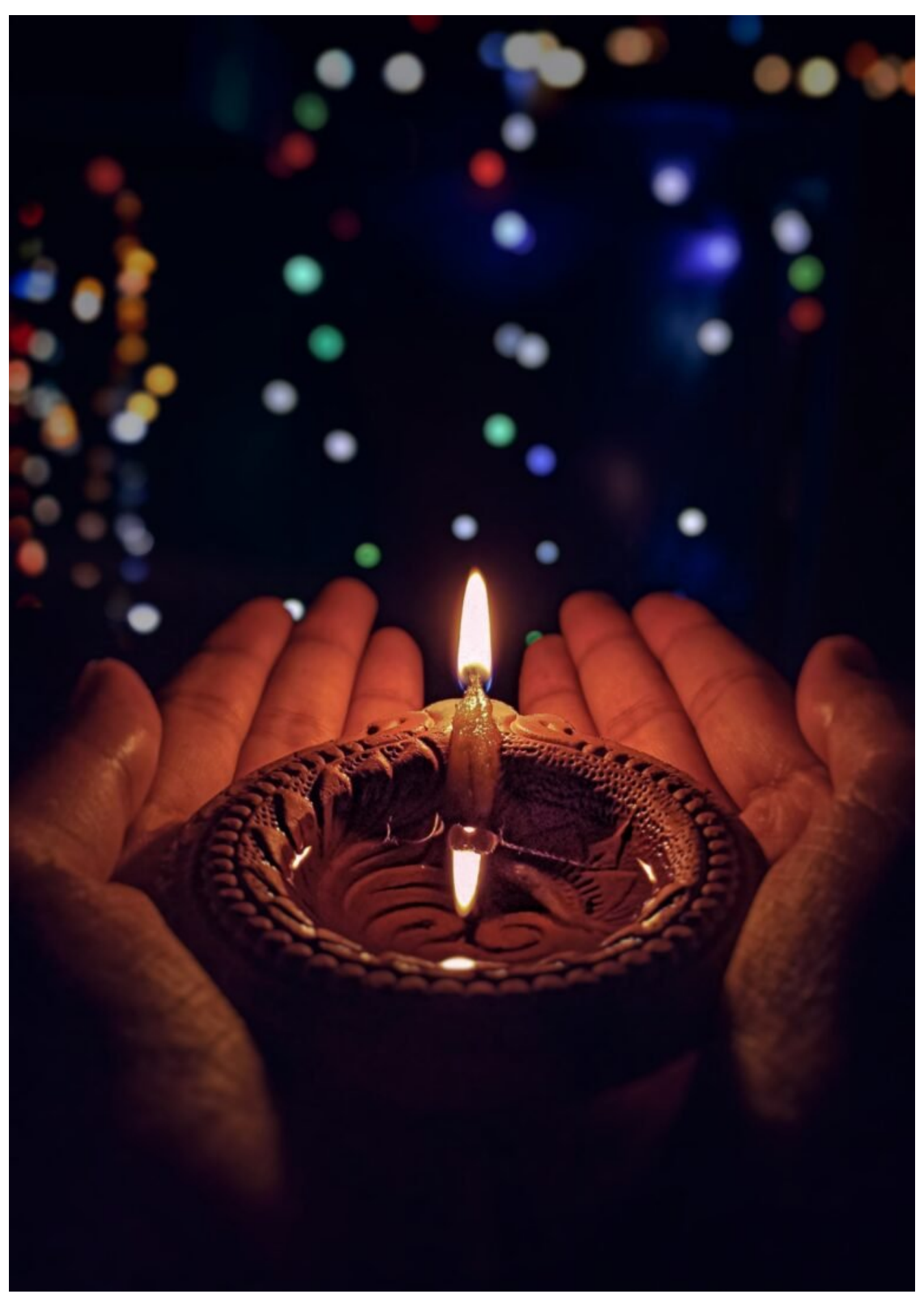
Diwali, also known as Dipawali, is one of the most celebrated festivals in <a href="India">India</a>. It is a national festival that signifies