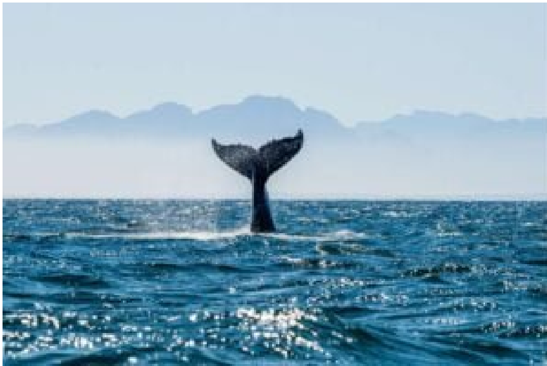
World Whale Day

What started as a local event to raise awareness for humpback whales has now grown into a global movement. World Whale Day aims to promote awareness of the deteriorating health of our oceans and the urgent need for action. It is a call to make the habitats of whales and other marine life safe and sustainable.