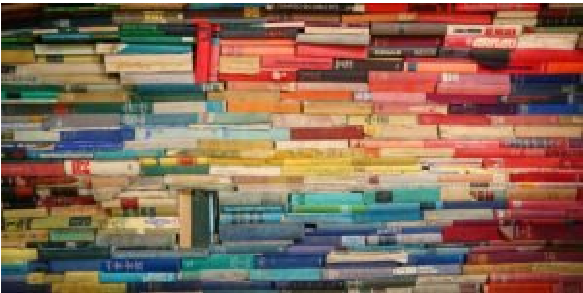
World Book Day

World Book Day also helps to foster a sense of community and shared experiences. It brings together children, parents, teachers, and authors, creating a vibrant literary culture . The event often includes author visits, storytelling sessions, and book-related activities in schools and libraries. These activities not only make reading fun but also inspire children to explore different genres and authors.