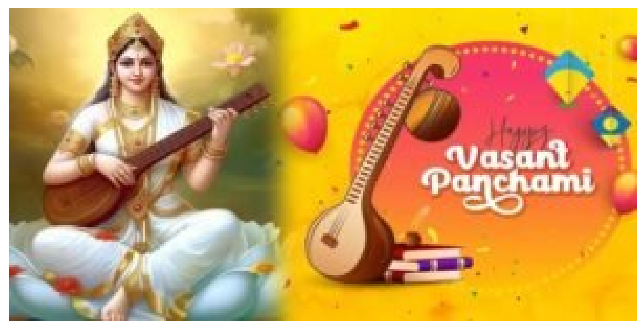
Happy Vasant Panchami 2024

On this day, people traditionally wear yellow attire, as it symbolizes the blossoming of spring and the vibrant energy associated with the <u>festival</u>. Yellow sweets, such as saffron rice or boundi laddoos, are prepared and shared as prasad among family and friends.