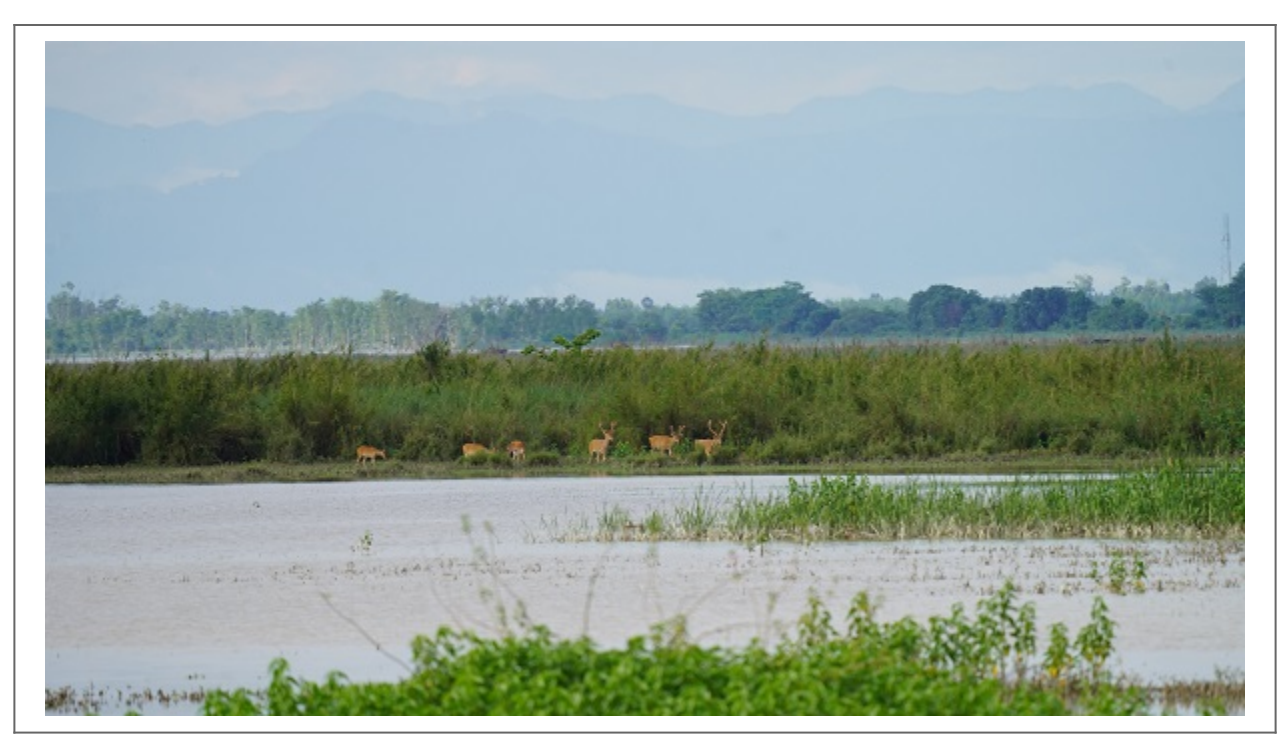
Grasslands are an ideal habitat for the endangered Swamp Deer