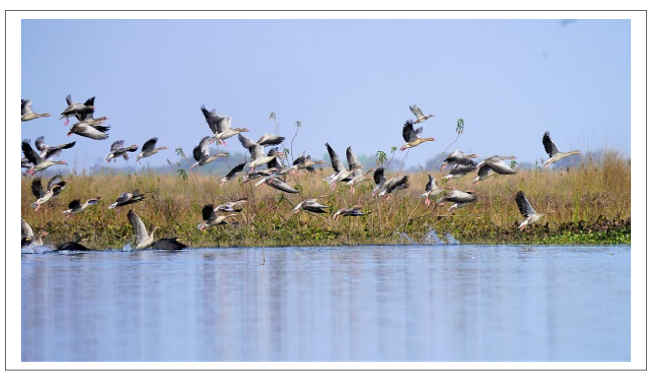
Haiderpur Wetlands are a popular wintering ground for 3000+ Grey