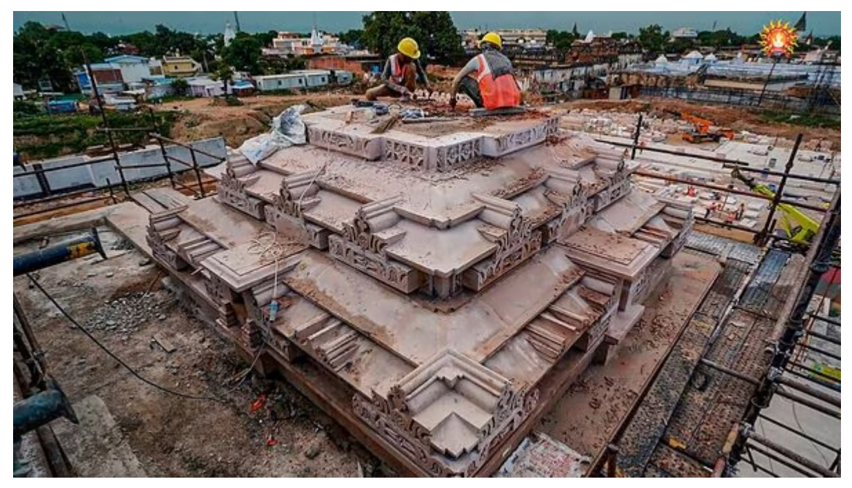
Ayodhya Ram Mandir

Mandir is around 18,000 crores. The funds for the project have been contributed by millions of devotees from all over the world, who have eagerly donated towards the noble cause. The construction of the temple is being carried out by skilled craftsmen and artisans, who are meticulously carving intricate designs and sculptures to adorn the temple.